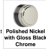
Polished Nickel with Gloss Black Chrome