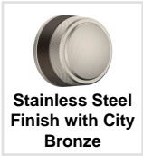
Stainless Steel Finish with City Bronze